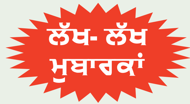
ਬੰਦੀ ਛੋੜ ਦਿਵਸ ਤੇ ਯੂਬਾ ਸਿਟੀ ਦੇ 34ਵੇਂ ਸਾਲਾਨਾ ਮਹਾਨ ਨਗਰ ਕੀਰਤਨ ਦੀਆਂ